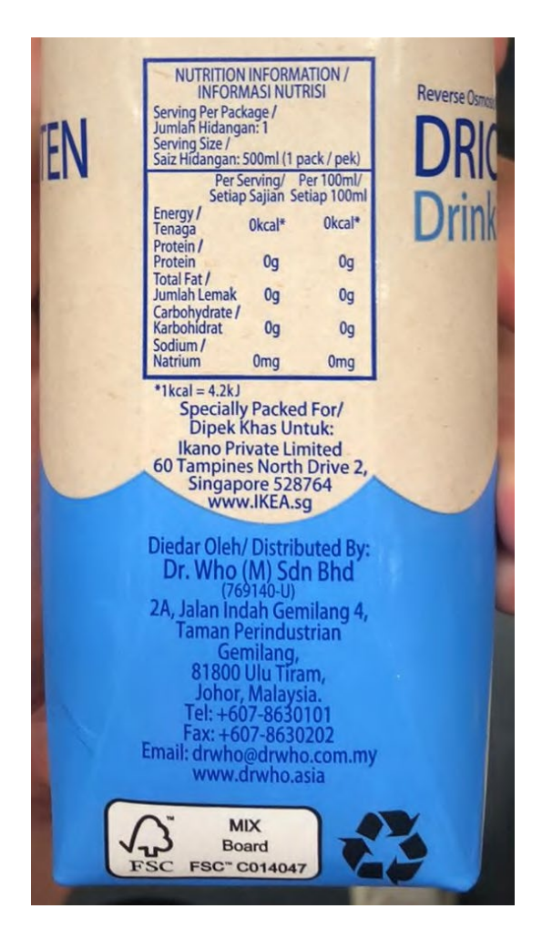
Use of the allegedly infringing sign

108 As previously stated at [60], the trade mark proprietor must establish (a) use of the infringing sign within Singapore's territory, (b) in the course of trade, (c) in a trade mark sense and (d) without the consent of the proprietor. Here, the "www.drwho.asia" sign was applied directly to the Cartons which were sold in Singapore – this fulfils the requirement of use under s 27(4)(a) of the TMA. I have also accepted at [68] that the application of this sign was done without the consent of the plaintiffs.